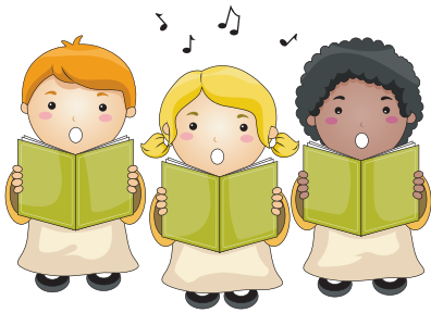
SING IN A CHOIR